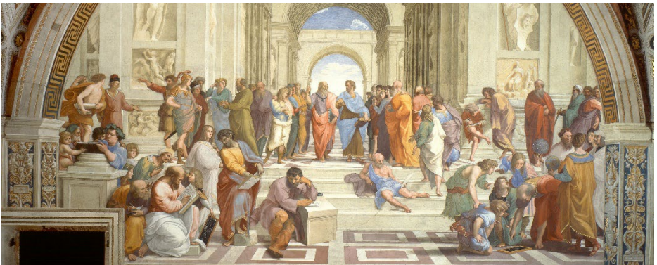
Raffaello Sanzio da Urbino, “The School of Athens” (1511)